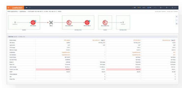
Flow Path Analysis provides hop-by-hop correlation of application and network performance