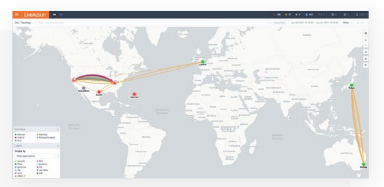
Topology views for enterprise wide visibility and situational awareness