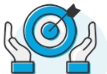
Support & Enable Business Objectives